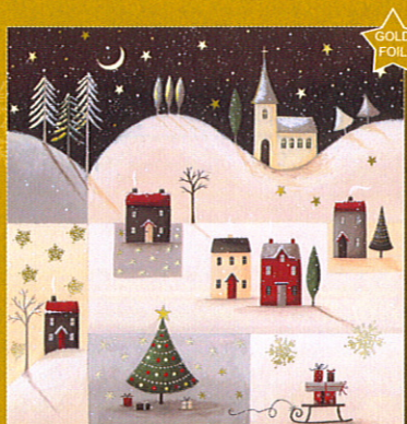
TN09 - Christmas Time 127 x 127mm 5" x 5" Price per pack of 10: £3.95