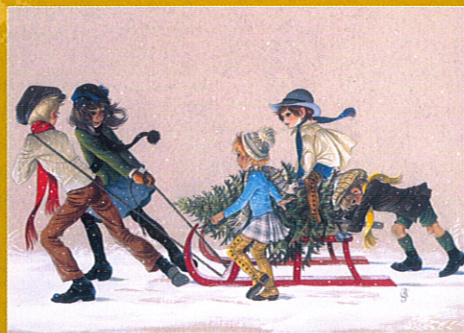
TN03 - Taking Home the Tree