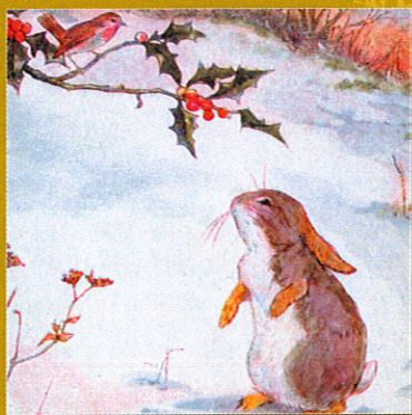
TN12 - Winter Friends 127 x 127mm 5" x 5" Price per pack of 10: £3.75