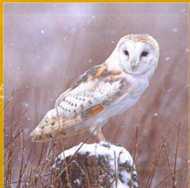
TN07 - Owl in Snow 127 x 127mm 5" x 5" Price per pack of 10: £3.75