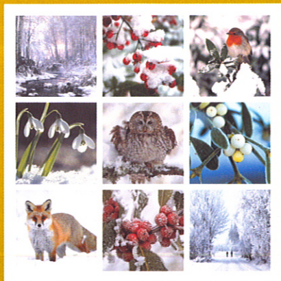
TN01 - Winter Frost