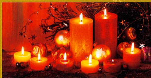
TN11 - Festive Glow 84 x 170mm 3¼" x 6¾" Price per pack of 10: £3.75