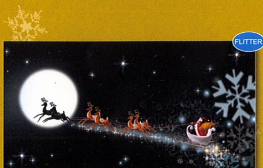
TN10 - Across the Night Sky 84 x 170mm 3¼" x 6¾" Price per pack of 10: £3.95